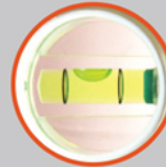
Plumb vial at eye level for easy viewing