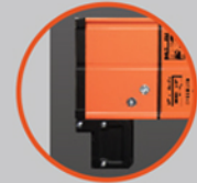
Replaceable stand-off ends