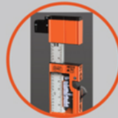
Low-friction, engineered brake pad