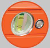
Triple-secured vial mounting system

Johnson's plate level includes a patented, triple-secured vial mounting system providing consistent, accurate readings and protection against pinch points. Features the fastest locking kit which is replaceable in under five minutes. It has a measuring scale with lock pins at every foot for fast set-up and positioning. The reinforced components and metal frame help prevent damage from drops and tips. Stand-offs easily clear braces or rest between top/bottom plate for single contact leveling.