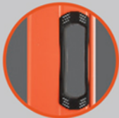
Ergonomic soft touch dual hand grips